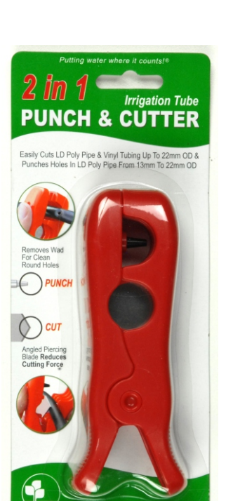
2 in 1 Punch & Cutter Retail Packaging