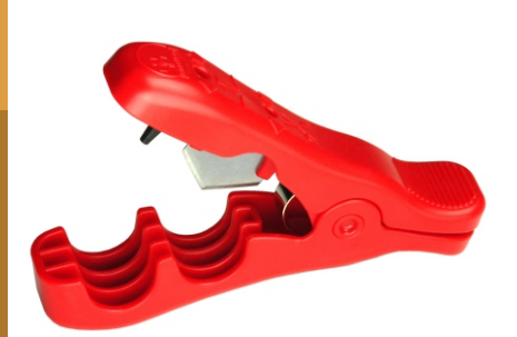
2 in 1 Punch & Cutter